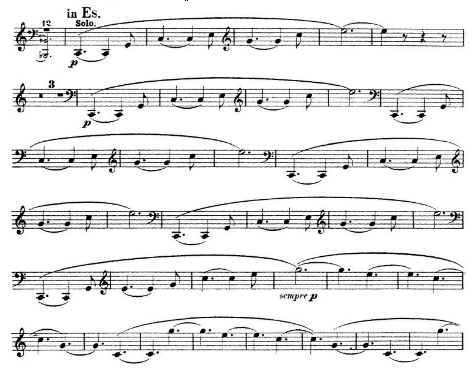
Weber – Der Freischutz Overture

Horn VIII in Eb, In moto tranquillo, sereno \frac{6}{8}