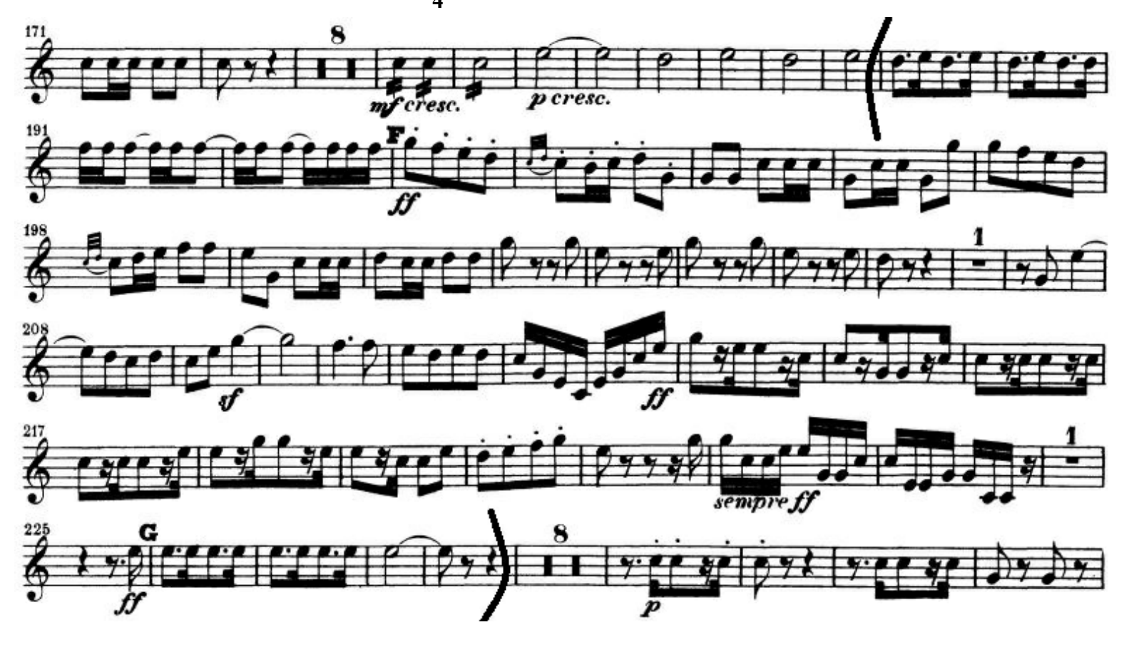
Horn IV in F, mvt. II, Vivace non troppo \frac{2}{4}