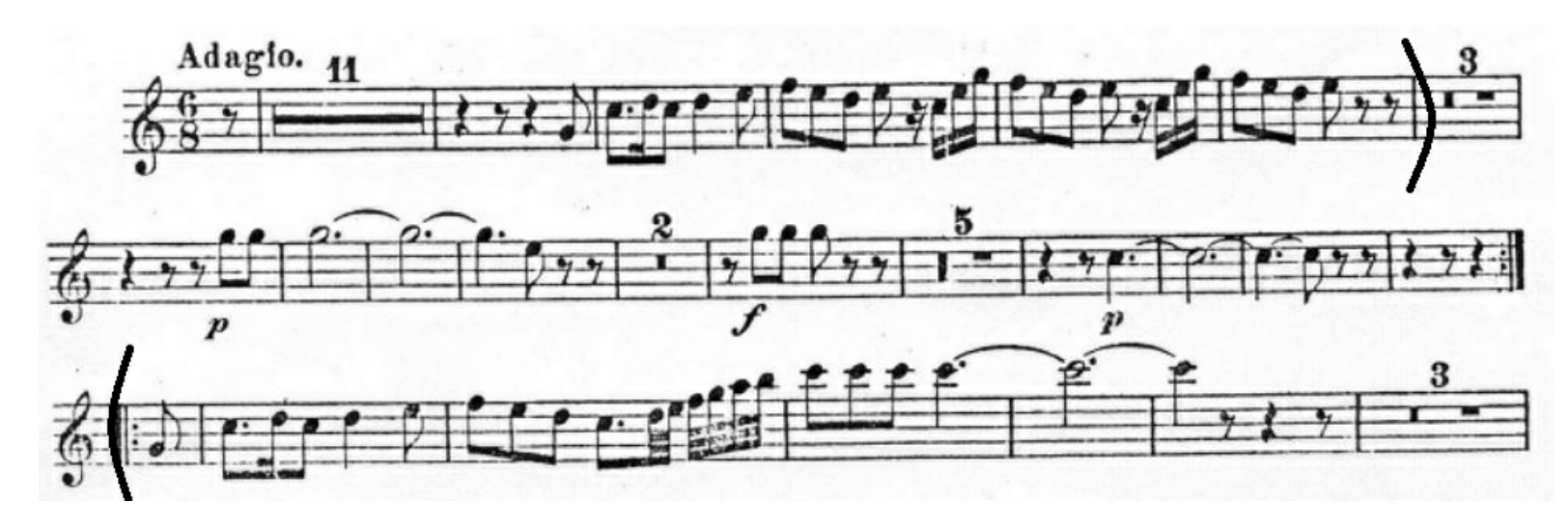
Horn II in D, mvt. II