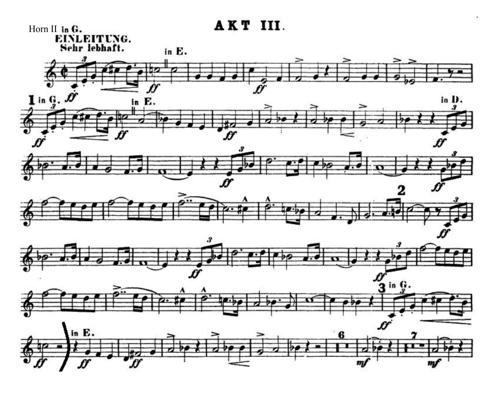
Weber: Oberon Overture