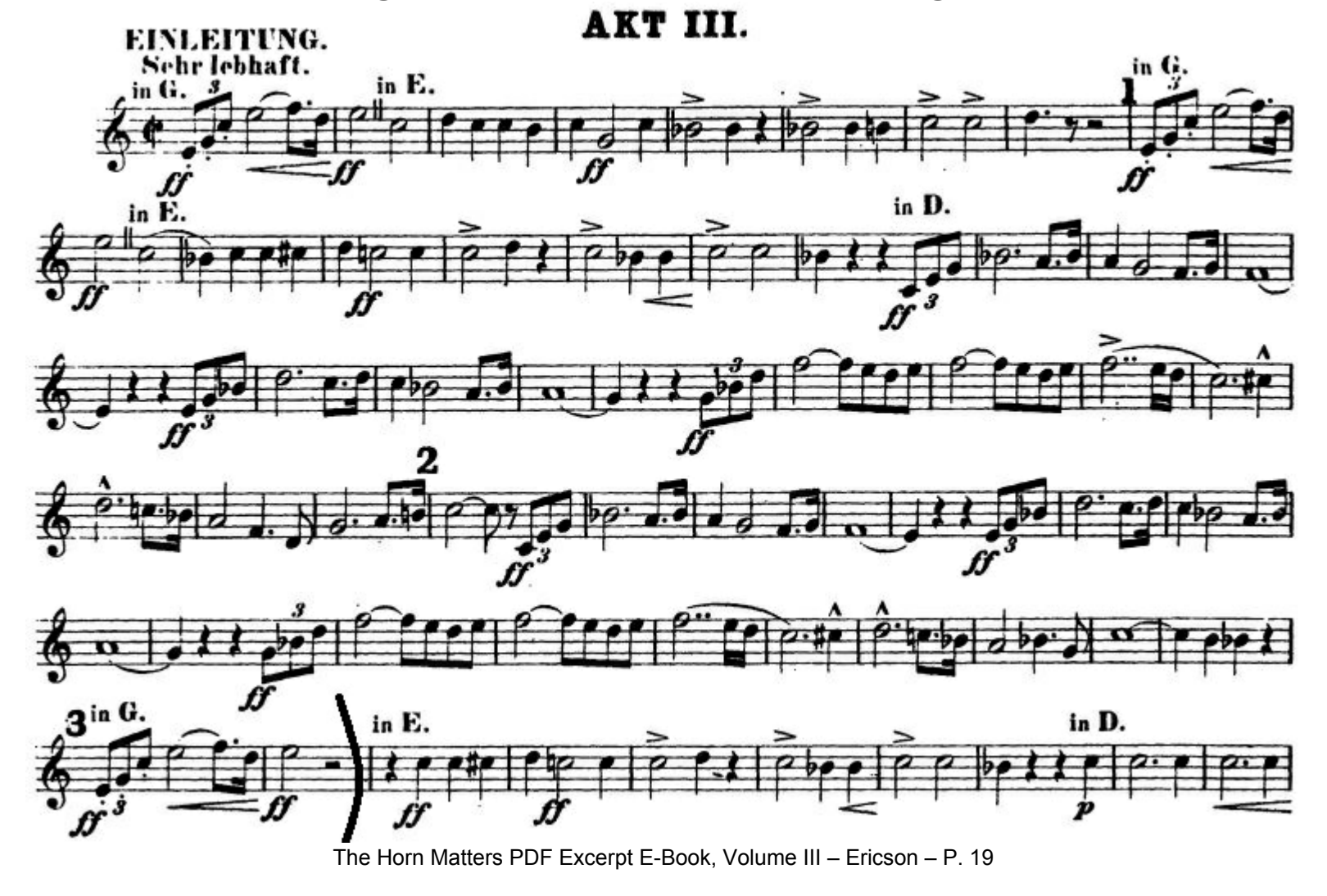
Wagner: Prelude to Act III of Lohengrin