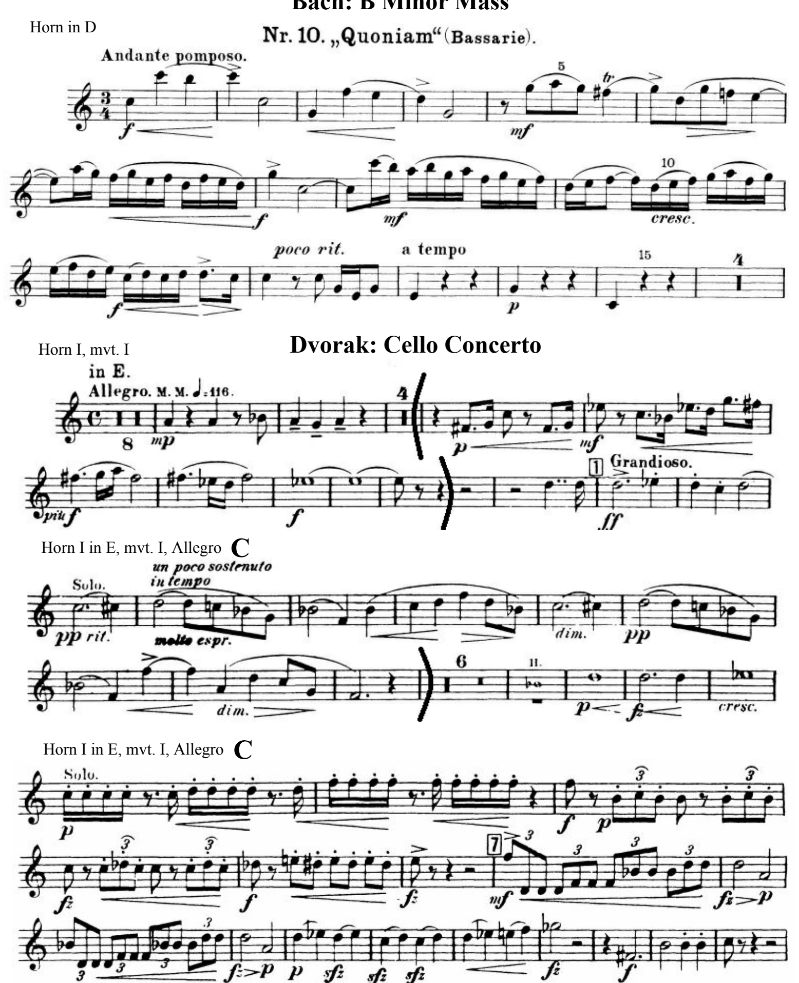
The Horn Matters PDF Excerpt E-Book, Volume III - Ericson - P. 5